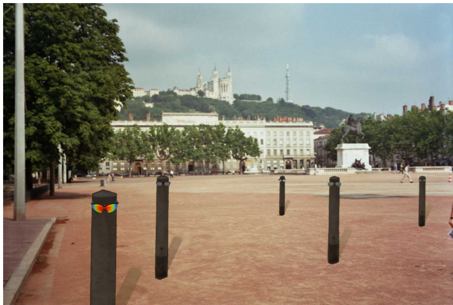
Photoshop rendering of how the sculptures will look on the square.

Note: The placement of the sculptures will be decided more carefully on site.